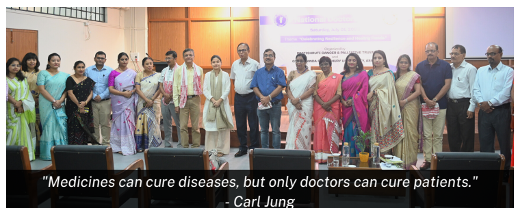
"Medicines can cure diseases, but only doctors can cure patients." - Carl Jung