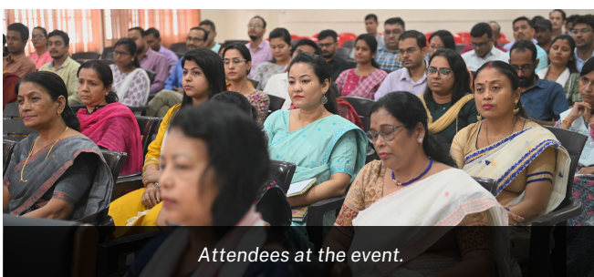
Attendees at the event.