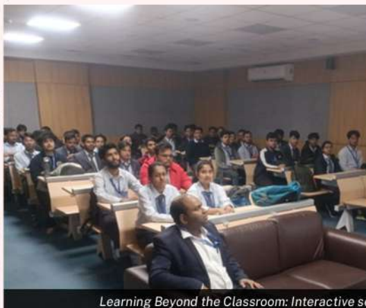
Learning Beyond the Classroom: Interactive session at STPI, Borjhar.