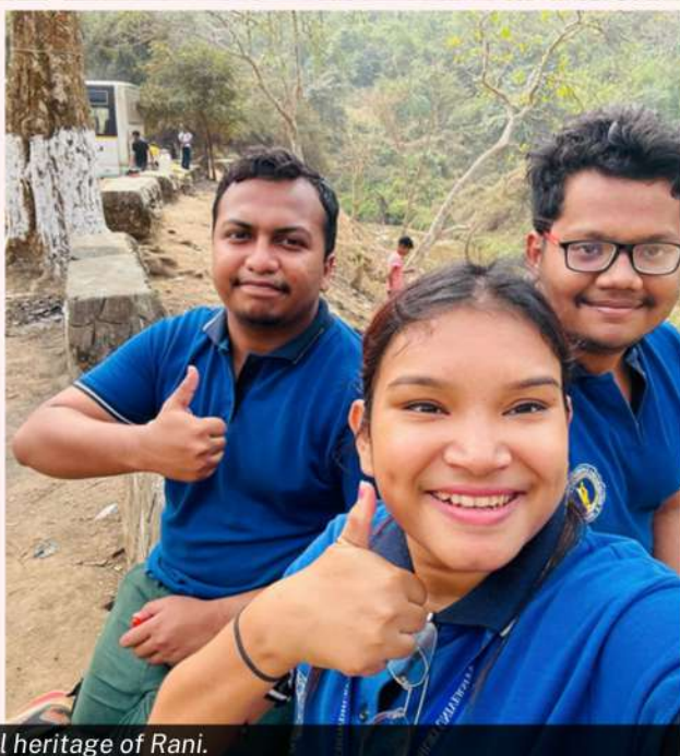
Unveiling the natural and cultural heritage of Rani.