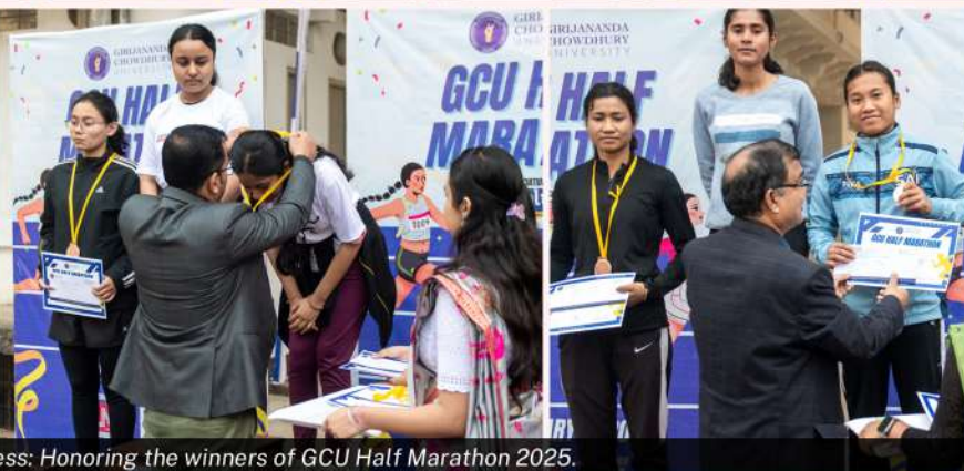
From stride to success: Honoring the winners of GCU Half Marathon 2025.