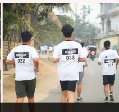
The race begins!

Commencing from Dharapur Higher Secondary School, the marathon spanned a challenging 13-kilometer route. Participants showcased remarkable perseverance and determination, making the event a resounding success.