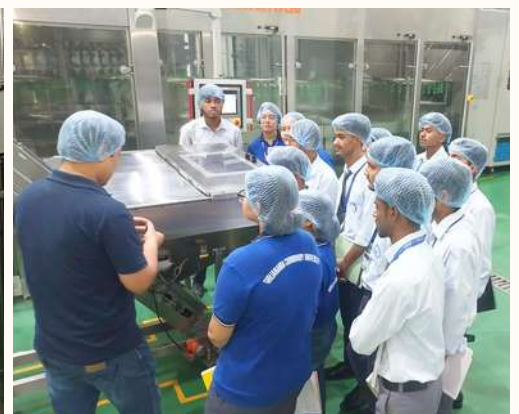
Students Exploring Real-Time Operations at Varun Beverages' Production Unit.