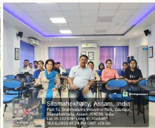
Students gaining insights into processing techniques and safety measure at Marico Ltd.