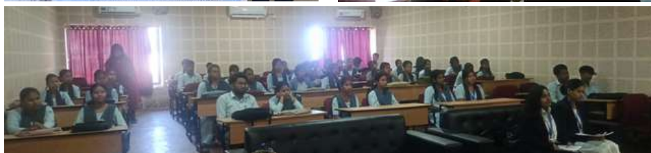
The awareness programme was conducted by Centre for Legal Studies, GCU.