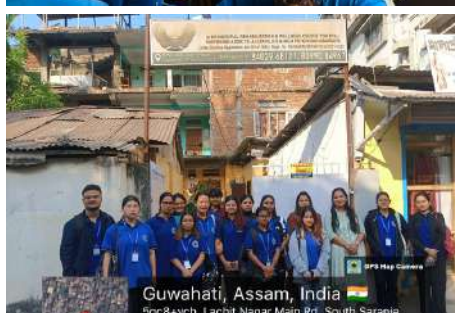
Vastab is a rehab center that treats addiction and mental health issues.