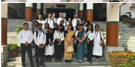
LL.M. students visited the library of the National Law University and Judicial Academy for academic enrichment.